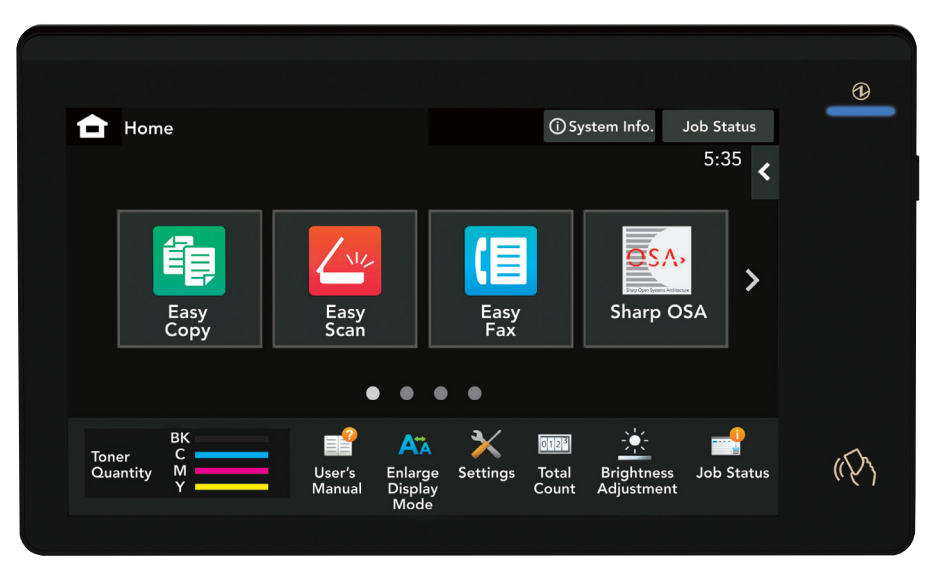
10.1" (diagonally measured) customizable touchscreen display.