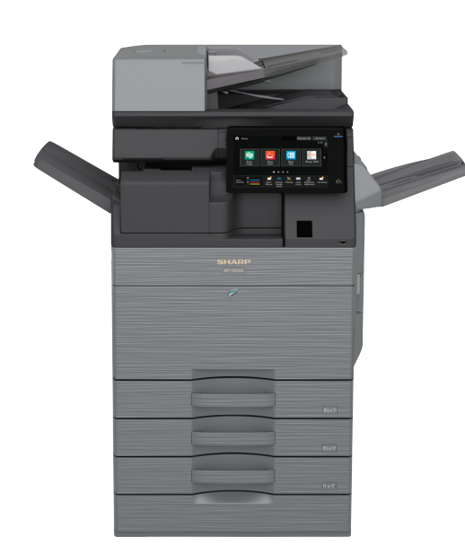
BP-70C65 shown with Inner Folding Unit, Right Side Exit Tray and 2-drawer Paper Deck.